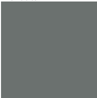
Bronze - BRZ